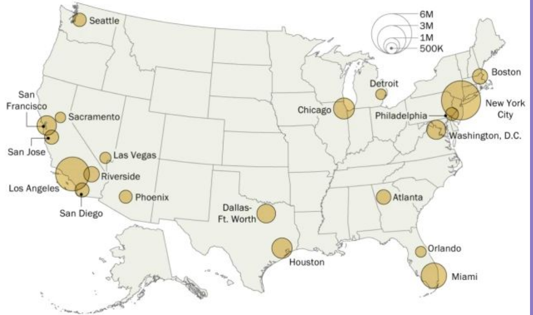
20 metropolitan areas with the largest number of immigrants in 2017